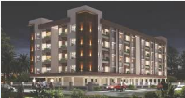
Evos Paradise | Apartment Project | Patrapada, Bhubaneswar