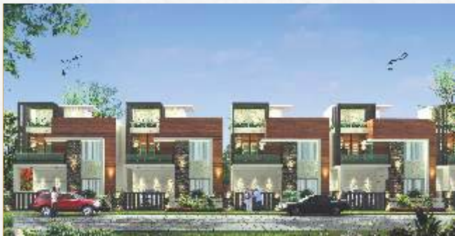
Evos Empire | Duplexes | Madanpur, Bhubaneswar