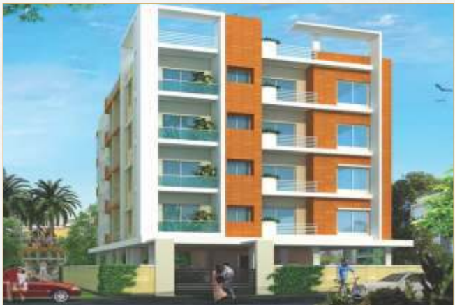
Olive Enclave | Apartment Project | Sailashree Vihar, Bhubaneswar