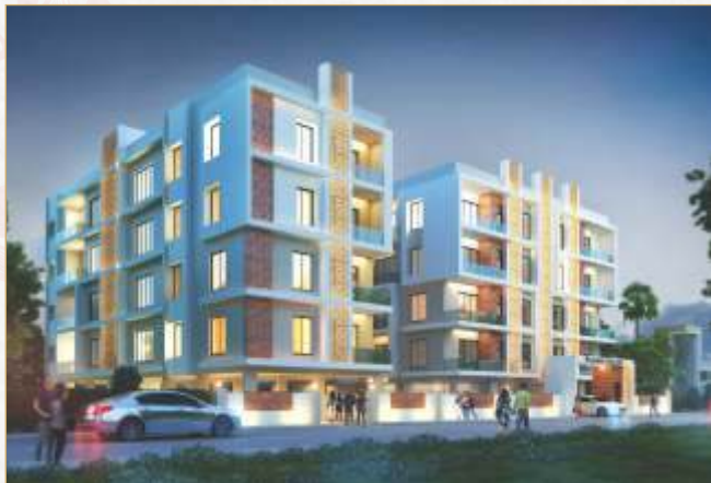
Bilasini Enclave | Apartment Project | Tamando, Bhubaneswar