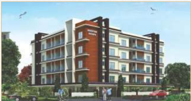
Mahavir Enclave | Apartment Project | Patrapada, Bhubaneswar