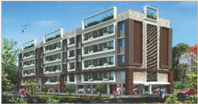
City Homes | Apartment Project | Khandagiri, Bhubaneswar