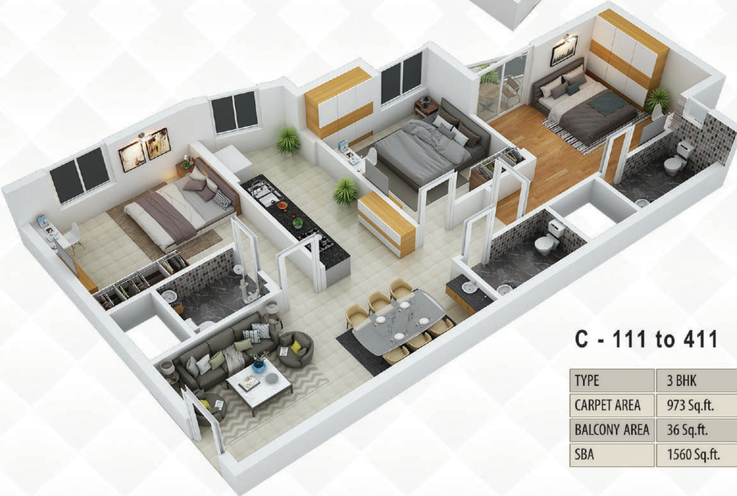
C - 111 to 411