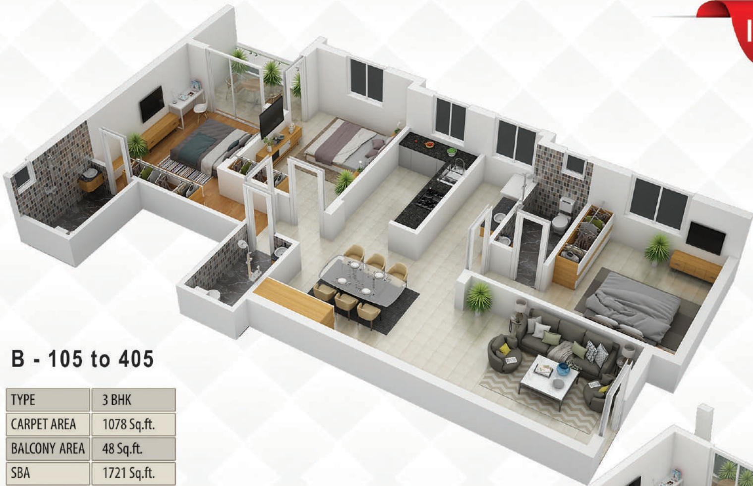
B - 105 to 405