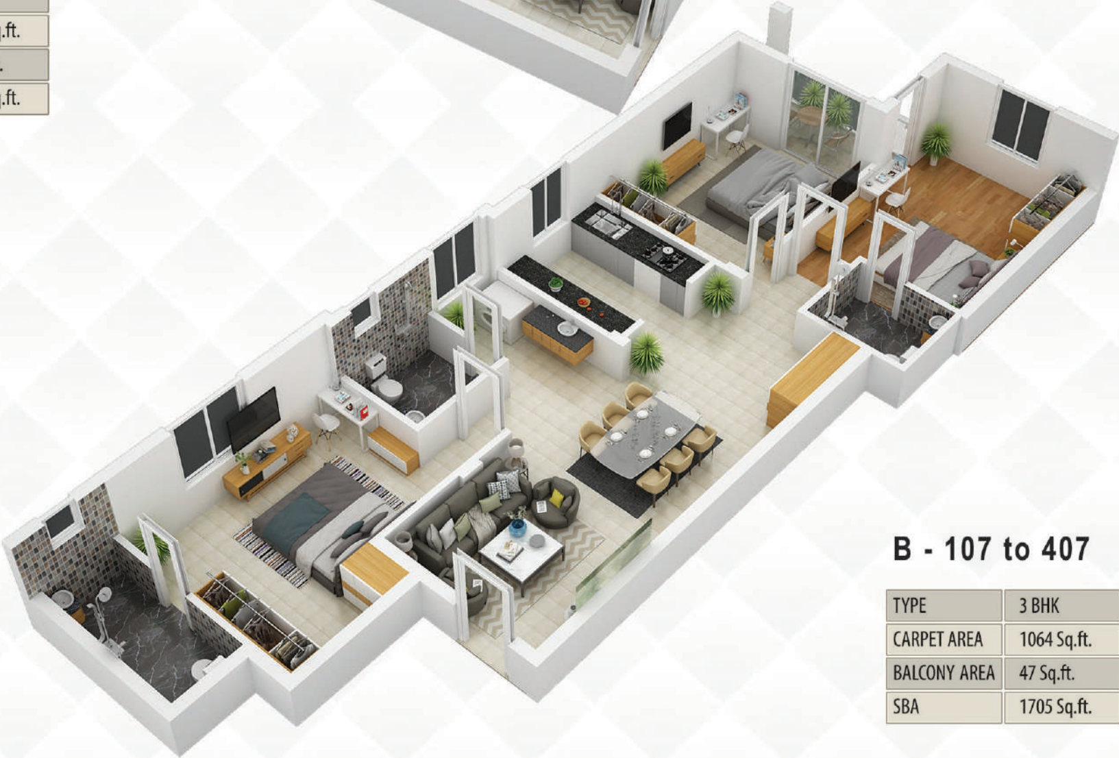
B - 107 to 407